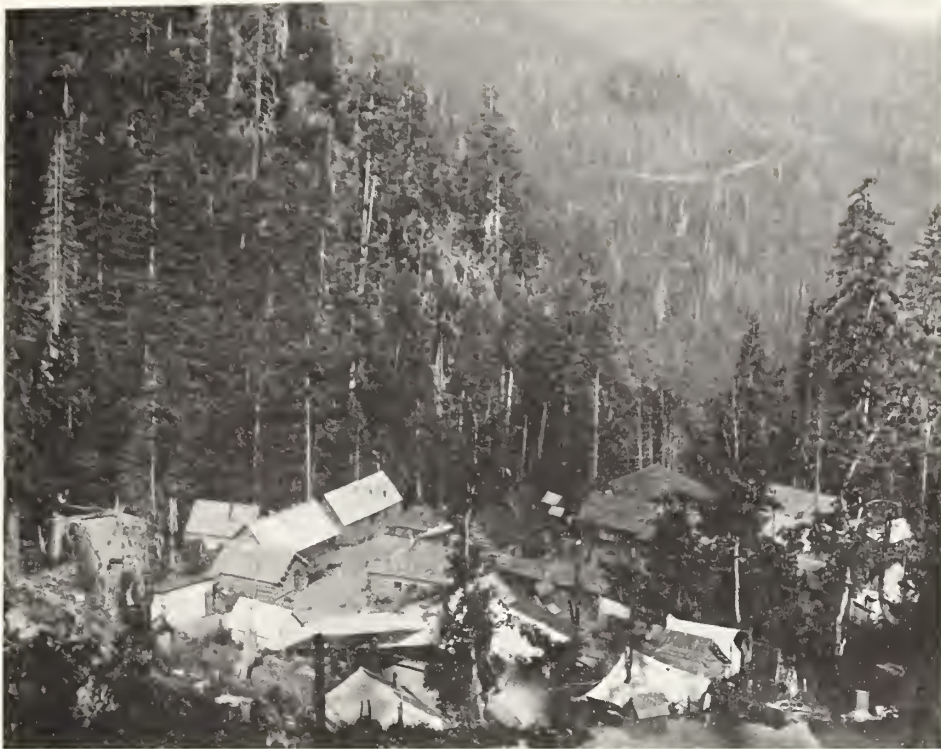
Figure 3. Early twentieth-century view of the Blue Ledge mine camp, perched on the steep slopes of the Joe Creek drainage.

Most of the Forest's turn-of-the-century mining sites have probably been included on the Inventory. The remaining number should be added by research and field reconnaissance. The mining activity of this era is fairly well documented by State and Federal reports and many sites are described in detail. Histories of development, equipment used and values produced are often given. The record is certainly not complete but far more is known about turn-of-the-century mining than that of the preceding years.